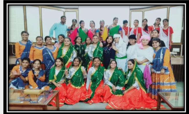
Performances by students - teachers