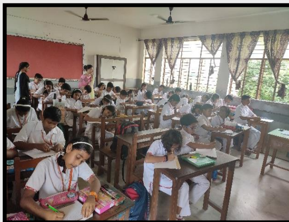
Students of class VI-A making poster on the topics "WATER CONSERVATION" and "BAN ON PLASTICS"