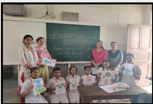
Students with their posters along with the Interns of ARMY INSTITUTE OF EDUCATION