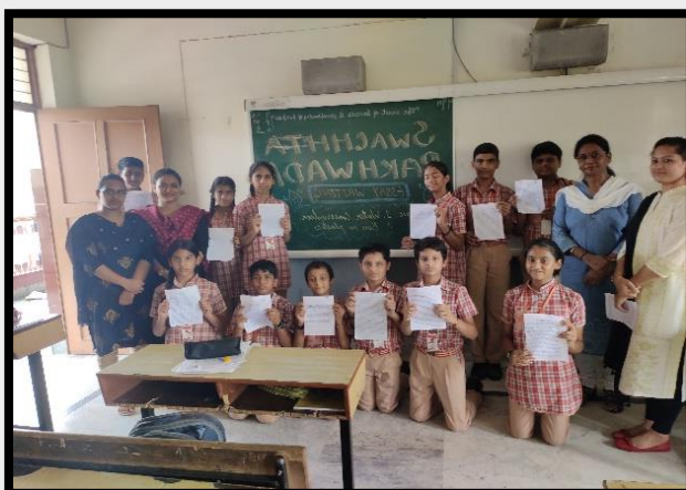
Students of class VII-A with their essays