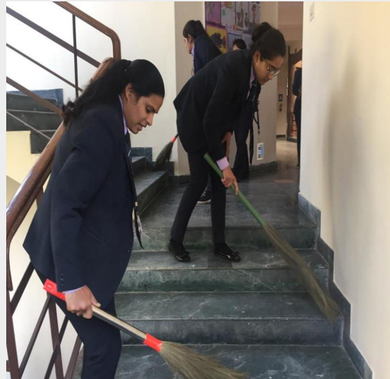
CLEANLINESS DRIVE IN CAMPUS BY ECO CLUB