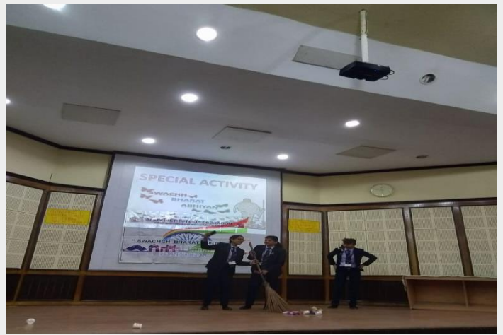
SKIT PERFORMED BY PRATIGYA HOUSE FOR SWACHHTA PAKHWADA ON 28 TH JAN.