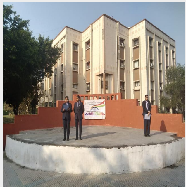
OATH TAKEN BY STUDENT TEACHERS AND STAFF OF THE COLLEGE.