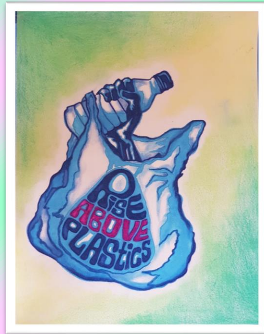
RISE ABOVE PLASTICS

The program began with the formation of teams, for enhancing the team spirit in the students while working.