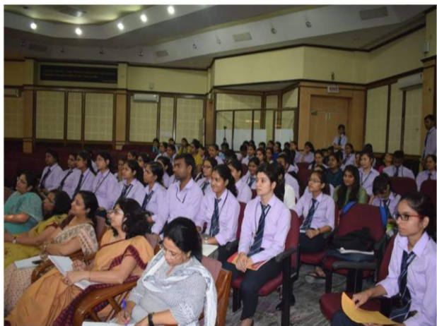
An engaged audience at AIE during the lecture.