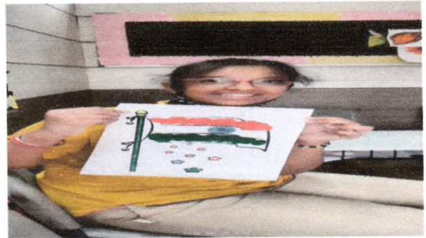
Flag coloring activity