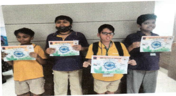
Facilitation (Certificates of participation)