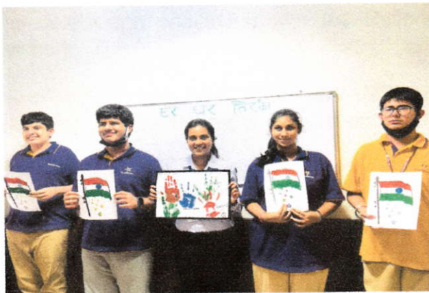
Showing their paintings and certificates