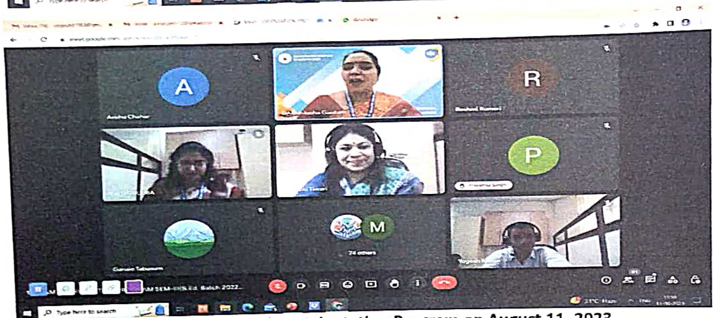
Glimpses of the Online Orientation Program on August 11, 2023