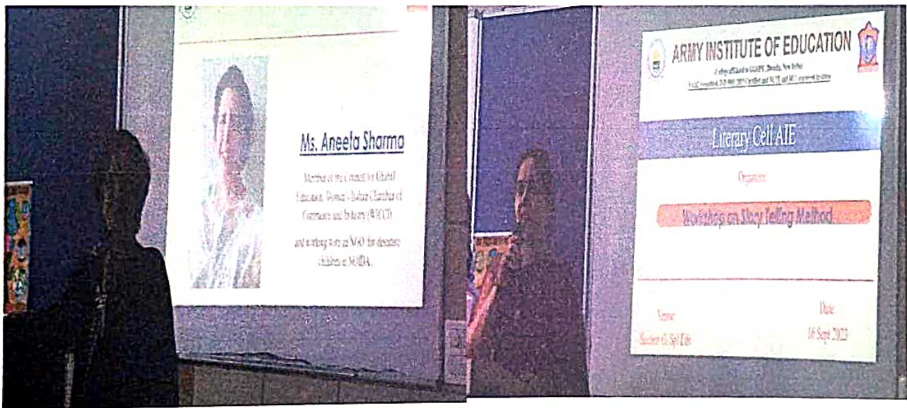
Glimpses of the workshop on the "Story Telling Method" On September 16, 2023

We extend our gratitude to all the participants, guest speakers, and organizers who made this event possible.