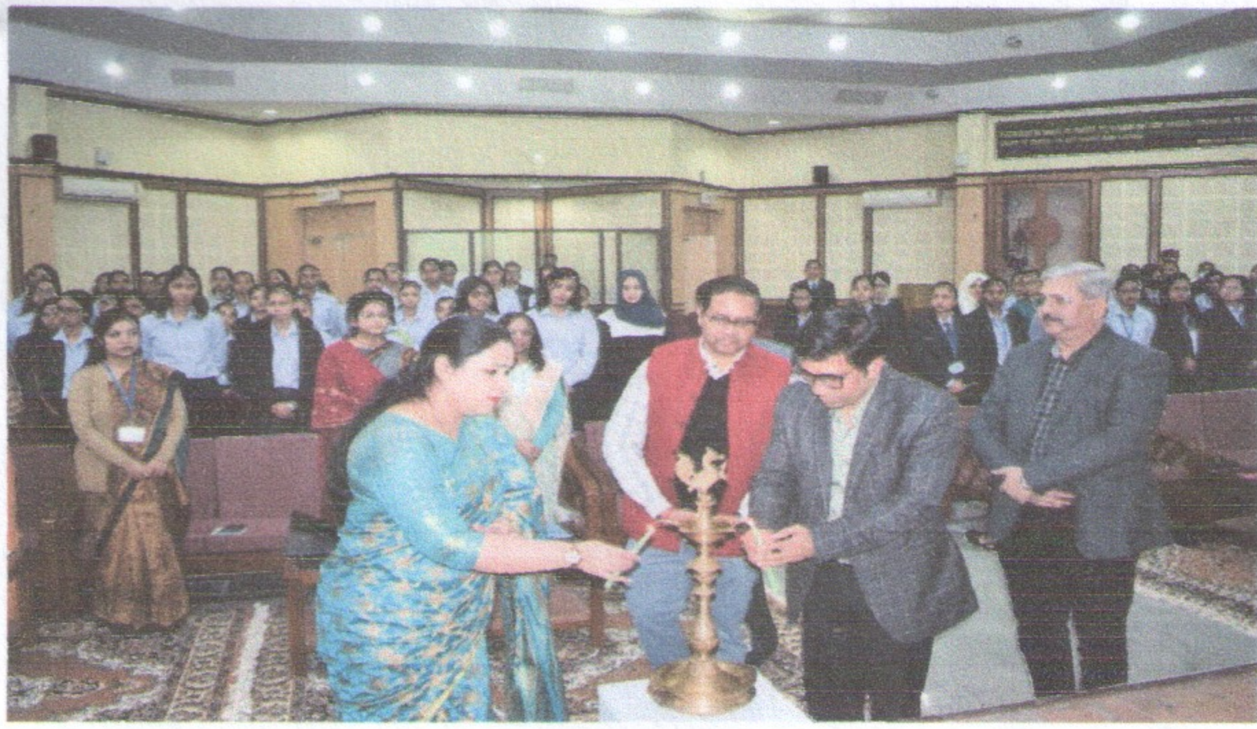
Figure 1 Lamp Lighting by the eminent Speakers & Principal, AIE