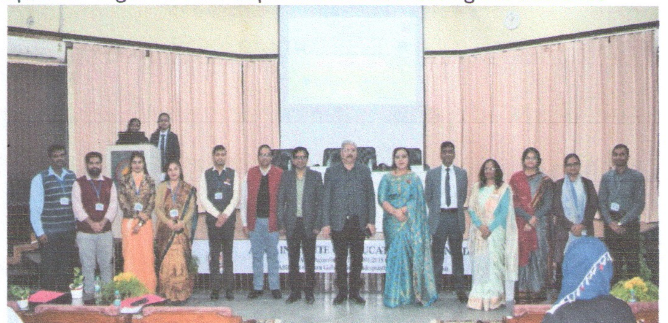
Figure 8 Galaxy of Eminent Speakers with AIE Fraternity