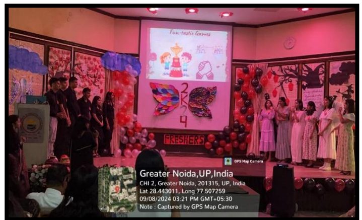
Ramp Walk by Juniors