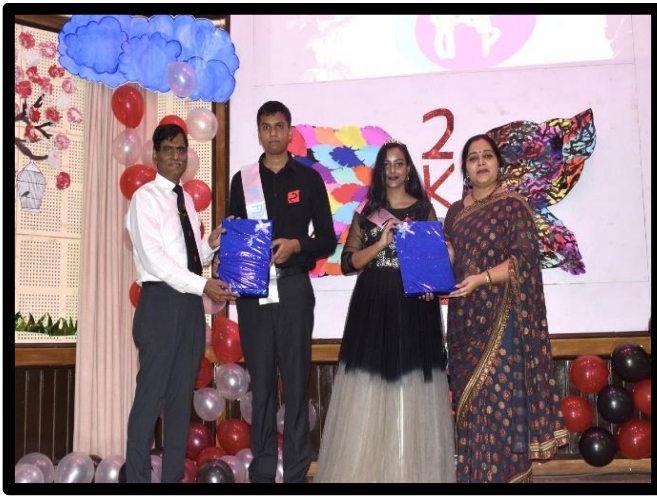
Mr & Miss Fresher