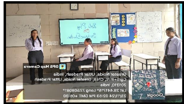
Glimpses of student teachers' performances during the role play activity