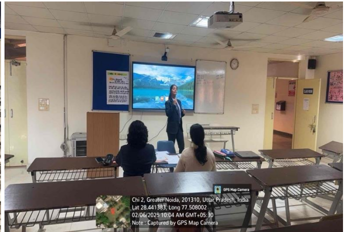
Faculty Members taking mock interview in different groups